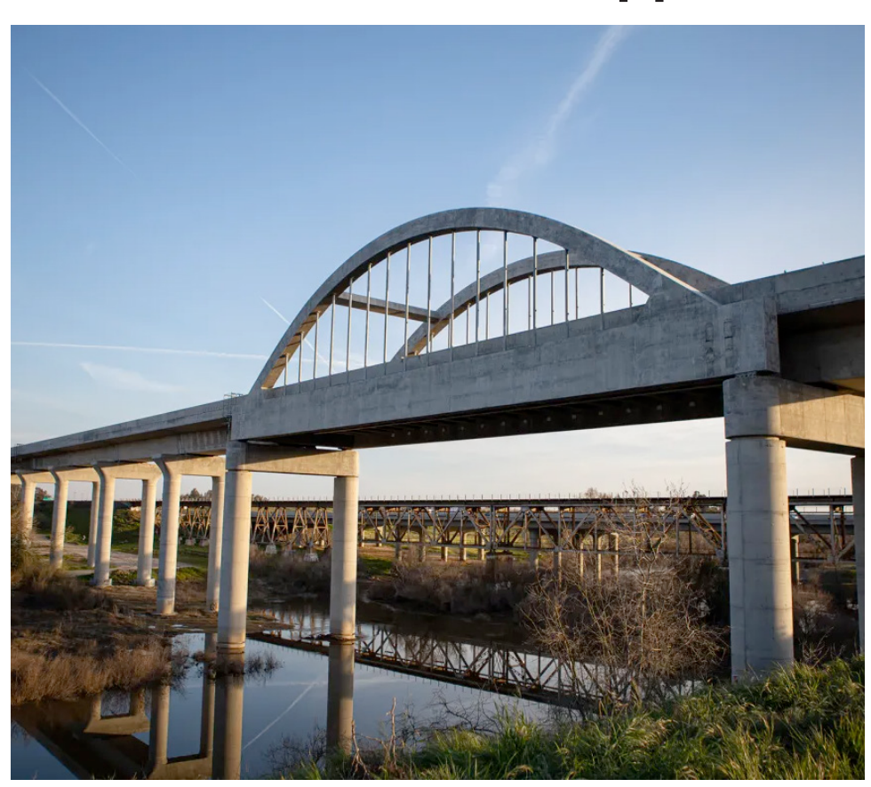
Construction of the High-Speed Rail going over the San Joaquin River along Highway 99 in north Fresno on March 3, 2023.

[ Article originally appeared in https://calmatters.org ]